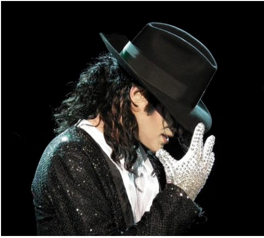
Michael Jackson Experience: I am King March 24

Today the Miller Theatre Advisory Board curates a wide spectrum of performances and programs to share and celebrate diverse artistic expression reflective of Houston. From rock to Bach, Miller offers the best in live music, dance, theatre, film and more. A few signature performances on the calendar include Juneteenth; the Houston Symphony Patriotic Fourth of July celebration with fireworks; Houston Shakespeare Festival; Cinco de Mayo; and countless other shows including the March 24 Michael Jackson Experience: I am King and the extraordinary collaboration of Bella Gaia and The Earth Harp Collective for the season finale on