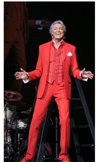
Tommy Tune shown far right.

Notable performers over the past 100 years include Tejano superstar Selena; Tony Award winner Tommy Tune; and Grammy Award winning performers Little Joe y La Familia, singer Arooj Aftab, Houston Chamber Choir and many more.